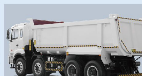
24m³ Dump Body

An extra tough chassis with high-bending strength for maximum load capacity.