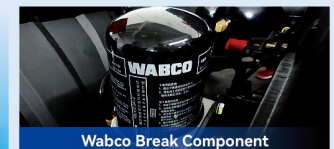
Wabco Break Component

International Top Brand Higher Breaking Efficiency