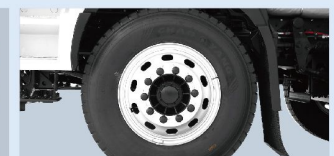
24-inch Tire Designed For Heavyload

30-ton payload, 10mm thickness bottom, 8mm thickness sides, Oversized capacity, reinforced dump body