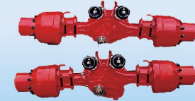
STR Technology Hub Reduction With Heavyload Capacity