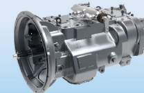
FAST 12MT Transmission